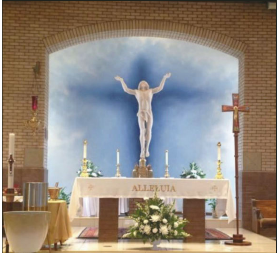
Altar of St. Rose of Lima Catholic Church in Milton, FL.