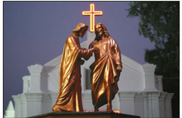
"Thomas and Jesus"

Jesus came, although the doors were locked, and stood in their midst and said, "Peace be with you." Then he said to Thomas, "Put your finger here and see my hands, and bring your hand and put it into my side, and do not be